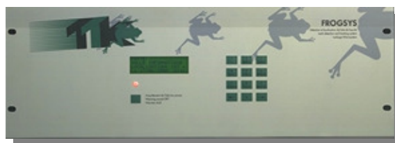
FG-SYS E, Digital Unit Rack Mounted, in 4U and 19" . Width: 484 mm and High: 176 mm