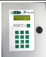
FG-SYS F, Digital Unit Wall Mounted Width: 200 mm, High: 250 mm, and Deep: 100 mm