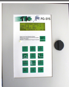
FG-SYS LL, Digital Unit Wall Mounted Width: 200 mm, High: 250 mm, and Deep: 100 mm